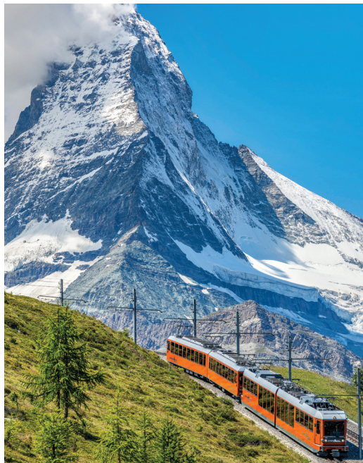
The Gornergratbahn open-air railway

Day 14: Depart for U.S. Transfer today to the Munich airport for your return flight to the U.S. B