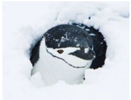
A chinstrap penguin burrowed in the snow.

This morning, the ship will be moored off of King George Island once again. Following disembarkation and Zodiac rides to shore, the flight departs the White Continent and returns to Puerto Natales for an overnight stay. (B,L,D)