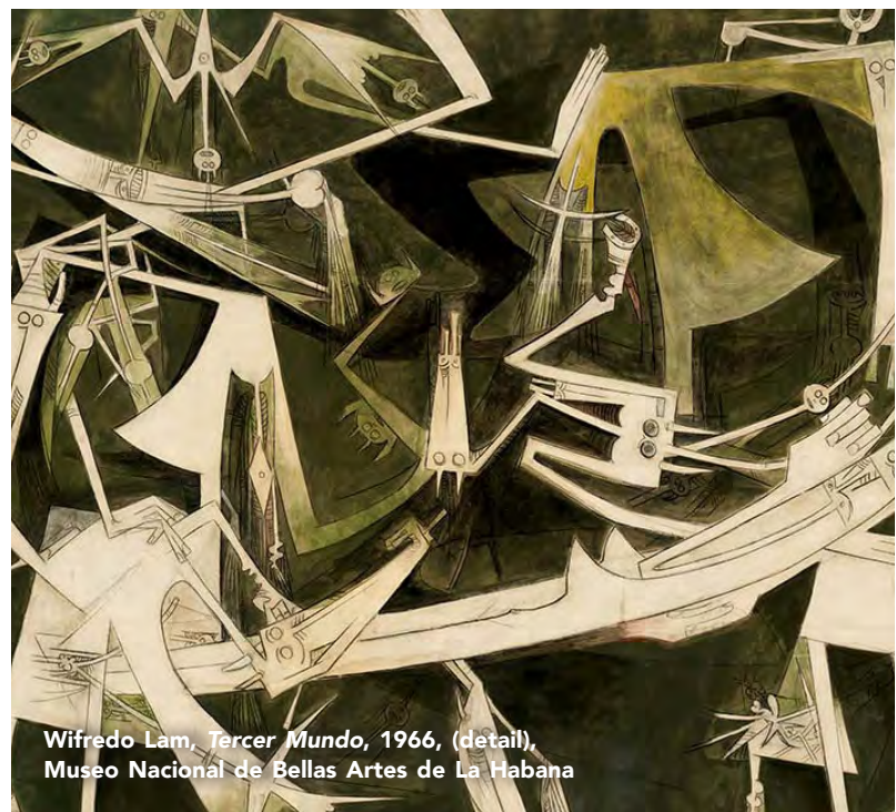
Wifredo Lam, Tercer Mundo , 1966, (detail), Museo Nacional de Bellas Artes de La Habana