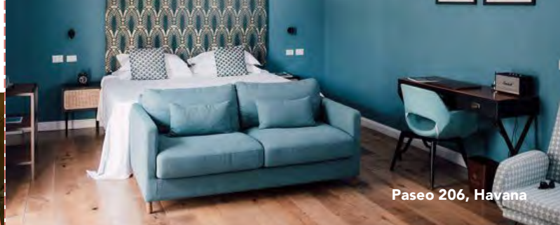
Paseo 206, Havana