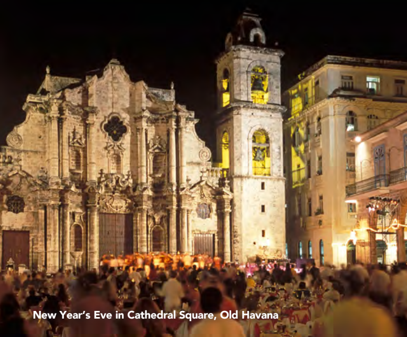
New Year's Eve in Cathedral Square, Old Havana

Afterwards, return to Havana and join a local expert at the Colón Cemetery , often referred to as Cuba's largest sculpture park. Admire the ornate tombstones commemorating Cuban heroes, statesmen, and novelists, each one a testament to Cuba's cultural heritage.