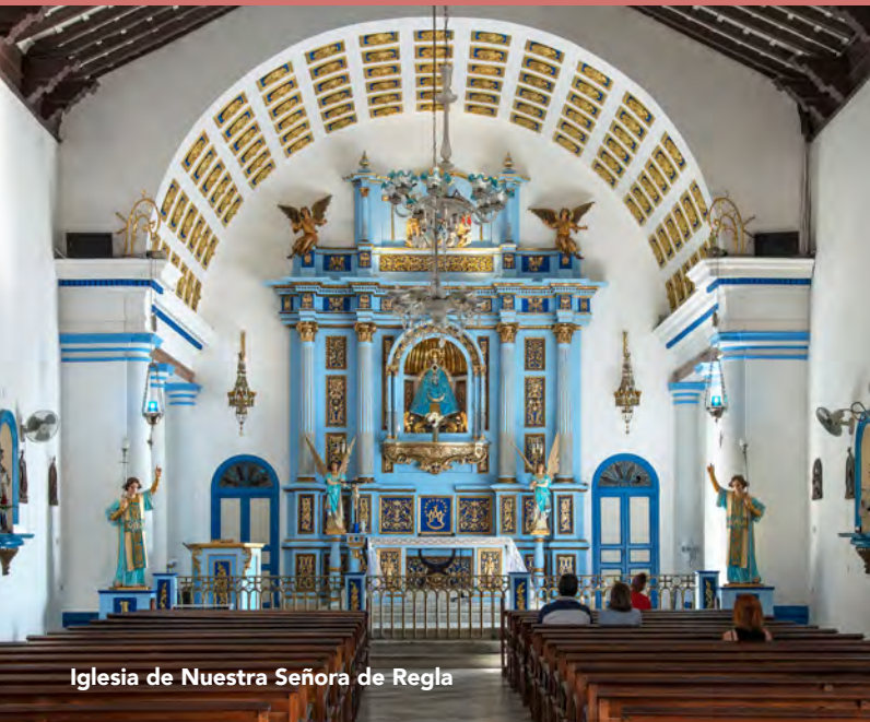
Iglesia de Nuestra Señora de Regla