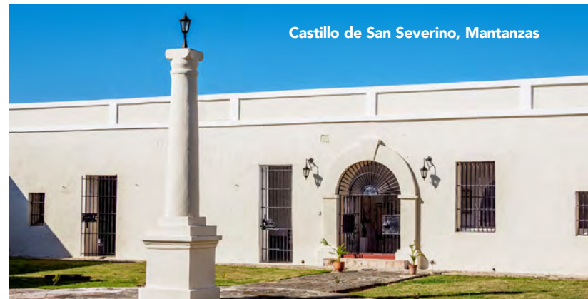
Castillo de San Severino, Matanzas

Depart the hotel this morning for the airport and your flight home. B