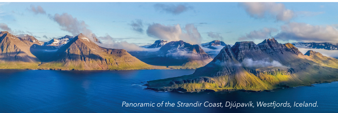
Panoramic of the Strandir Coast, Djúpavík, Westfjords, Iceland.

Discover the hard-to-reach coastal villages and volcanic isles of northwest Iceland on a six-day voyage. Hike and bike along rugged fjords and encounter stunning waterfalls and nature-filled landscapes. Set out by Zodiac to navigate dramatic shorelines—from the ethereal cliffs of the Westfjords to the storied and adventurous Skagafjörður region—and watch for whales as you experience the living legacy of Viking explorers and intrepid fishermen.