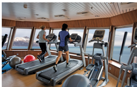
Fitness center with panoramic views.

The vessel is staffed by a wellness specialist and features a glass-enclosed fitness center, outdoor stretching area, LEXspa treatment room, and sauna.