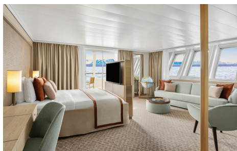
Newly renovated Category 7 suite with balcony.

All cabins and suites face outside with windows or portholes, and have a private bathroom and climate controls. Equipped with Wi-Fi, multiple electrical outlets, USB outlets, full-length mirror, and phones. TV featuring entertainment on demand, live feed from onboard presentations, bow camera, and ship's position. Luxury bed linens and pillows. Botanically inspired shampoo,