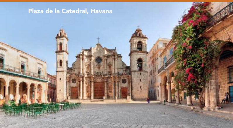
Plaza de la Catedral, Havana