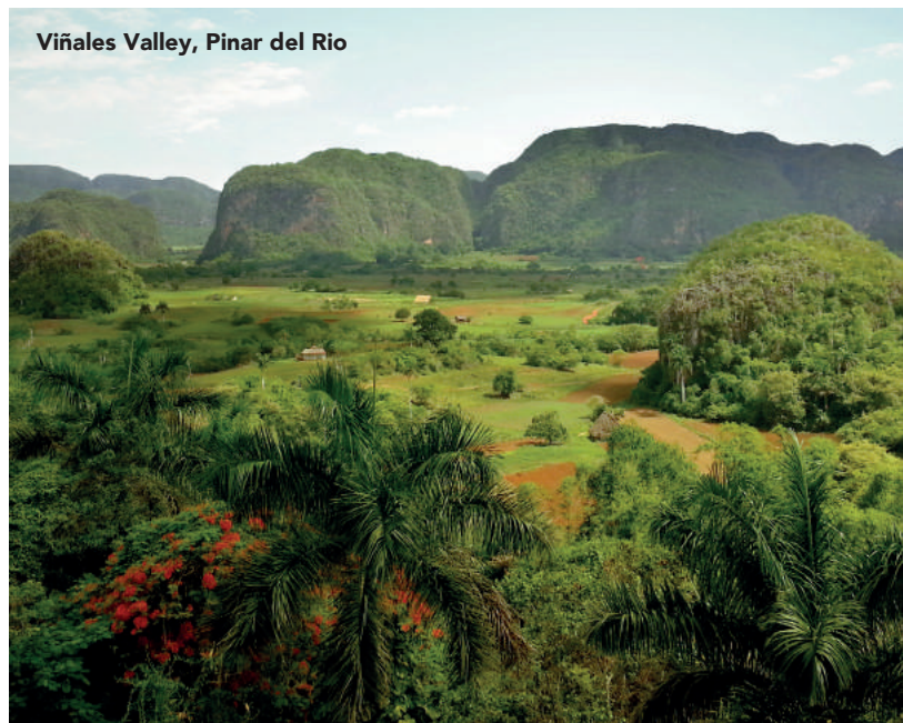
Viñales Valley, Pinar del Río

Attend a private after-hours tour and reception at the Museo Nacional de la Cerámica Contemporánea Cubana , housed in the 18th-century Casa Aguilera. In the early evening, drive to The Ludwig Foundation of Cuba , one of only a few Cuban NGOs, for a presentation on Cuban art. The Foundation's President will host a cocktail reception and buffet dinner on the penthouse terrace, where guests will include local Cuban artists. B,L,R,D