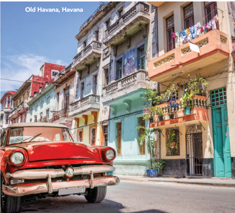
Old Havana, Havana