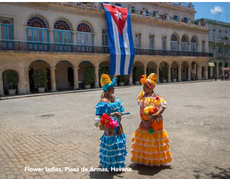
Flower ladies, Plaza de Armas, Havana

NOT INCLUDED IN RATES: International airfare (which includes the Cuban departure tax); Cuban visa (approx. $100, subject to change); limited Cuban health insurance policy (required for all foreign travelers to Cuba under age 80); passport fees; alcoholic beverages other than what is noted in inclusions; personal items and expenses; travel insurance; trip insurance; any other items not specifically mentioned as included.